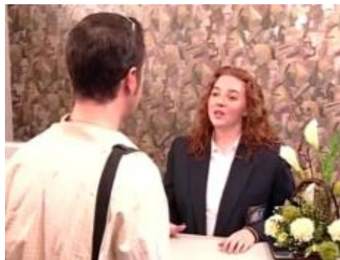
Picture 3. Video Conversation at Desk Hotel

The lecturer also used some authentic auditory material, such as videos and songs. Also, the instructor taught videos. When the lecturer wanted to use the video in his teaching, he played and showed the videos with the LCD projector to the students. He told the students to watch the videos and to see what they had. The instructor then asked the students for their views on the video.