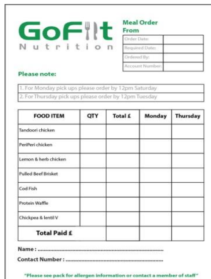
Picture 2. Order Form as Authentic Print Material

Forms of order and menus had also been used to improve the speaking skills of students. Once students were waiters, they learned to speak to the clients as to how to deliver food, drink or other service. The lecturer used all these tools to carry the real world job situation into the classroom.